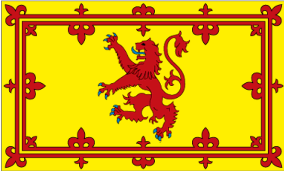
Royal Standard of Scotland [Ratio 1:2]

This is NOT a national flag and its use by citizens and corporate bodies is entirely wrong. Gold, with a red rampant lion and royal tressure. It is the Scottish Royal banner, and its correct use is restricted to only a few Great Officers who officially represent the Sovereign, including the Secretary of State for Scotland as Keeper of the Great Seal of Scotland, Lord Lieutenants in their Lieutenancies, the