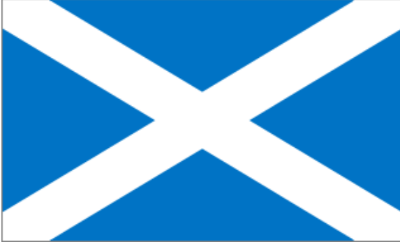
National Flag "St. Andrew's Saltire" [Ratio 3:5]

The Saint Andrew cross is one of the oldest national flags of all, dating back at least to the 12th century, although the honour of the oldest flag among the modern nations generally falls to the flag of Denmark.